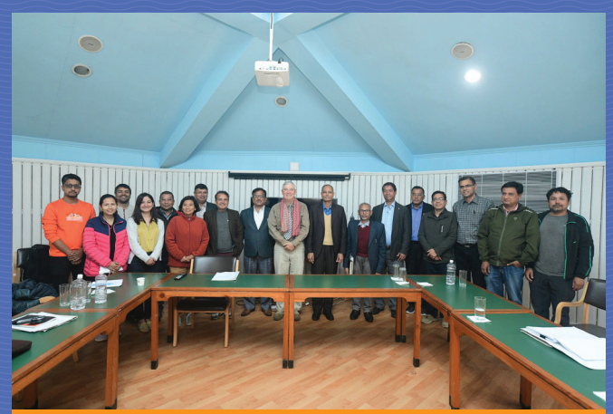
Group photo after Ph.D. Final defense of an International Candidate